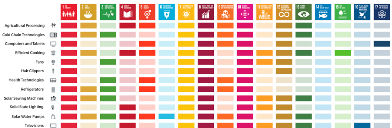
Figure 1. SDGs Impact by High-performing Appliances (Efficiency for Access Coalition)

High-Performing Appliances Help Achieve the UN Sustainable Development Goals